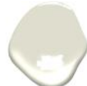
Morning Dew OC-140