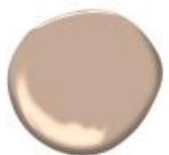
Venetian Portico AF-185