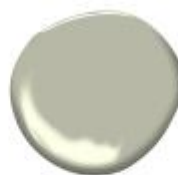
October Mist 1495