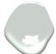
Quiet Moments 1563