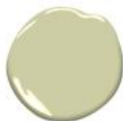
Fernwood Green 2145-40