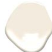
Collector's Item AF-45