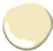
Pale Moon OC-108