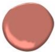
Wild Flower 2090-40