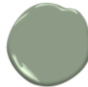
High Park 467