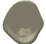
Gloucester Sage HC-100