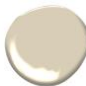
Natural Linen 966