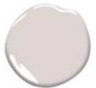
Hint of Violet 2114-60